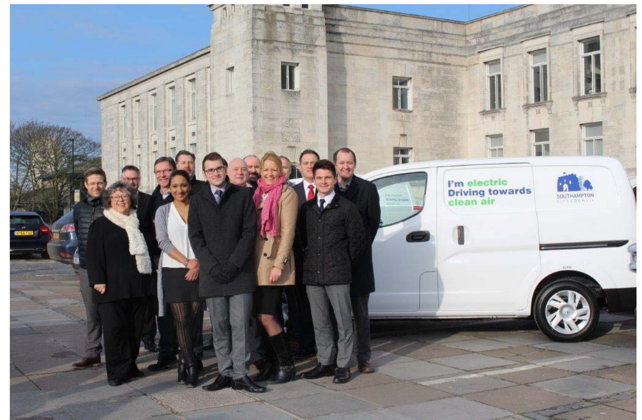
Southampton City Council team and newly acquired EV