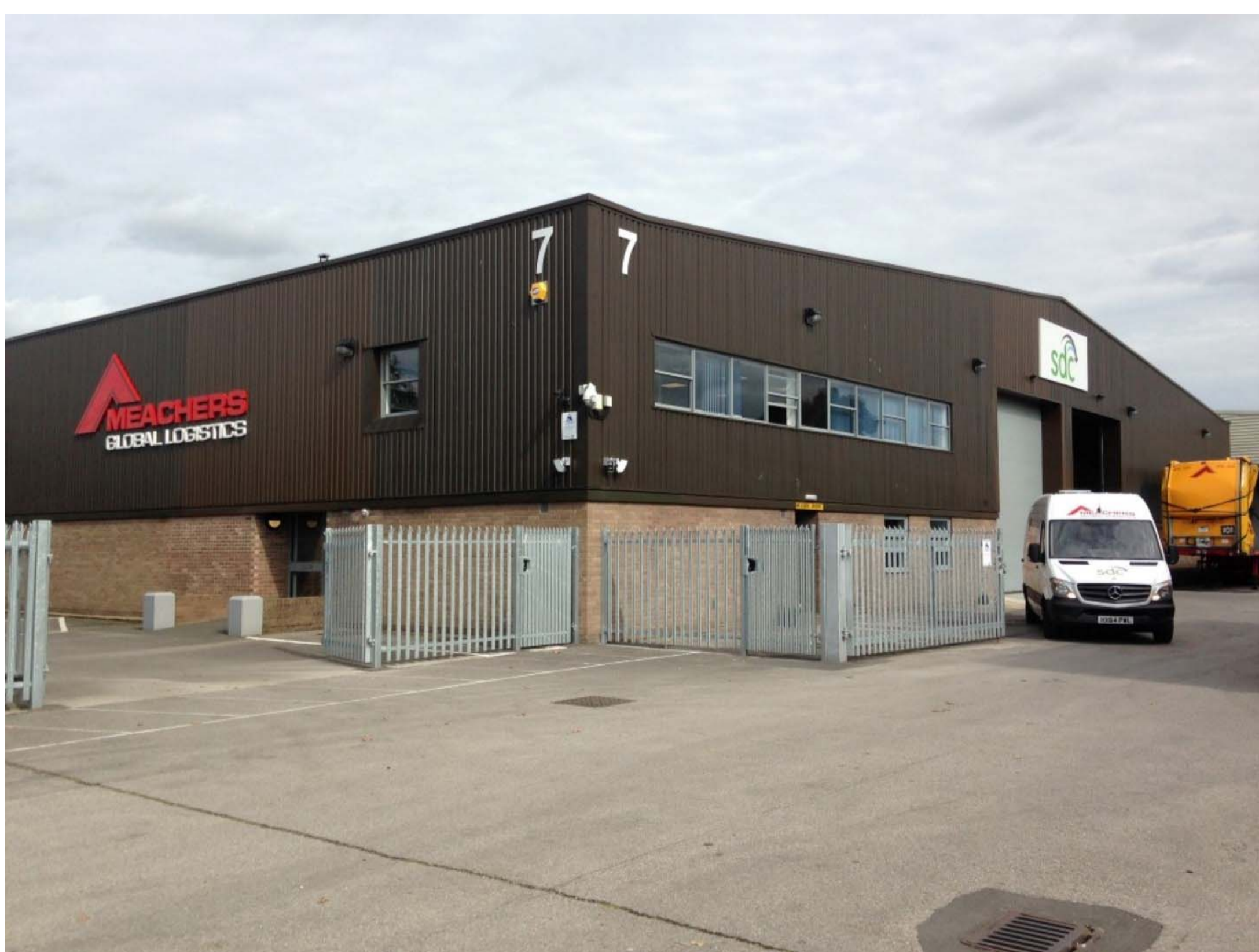
Southampton's SDC (operated by Meachers Global Logistics)